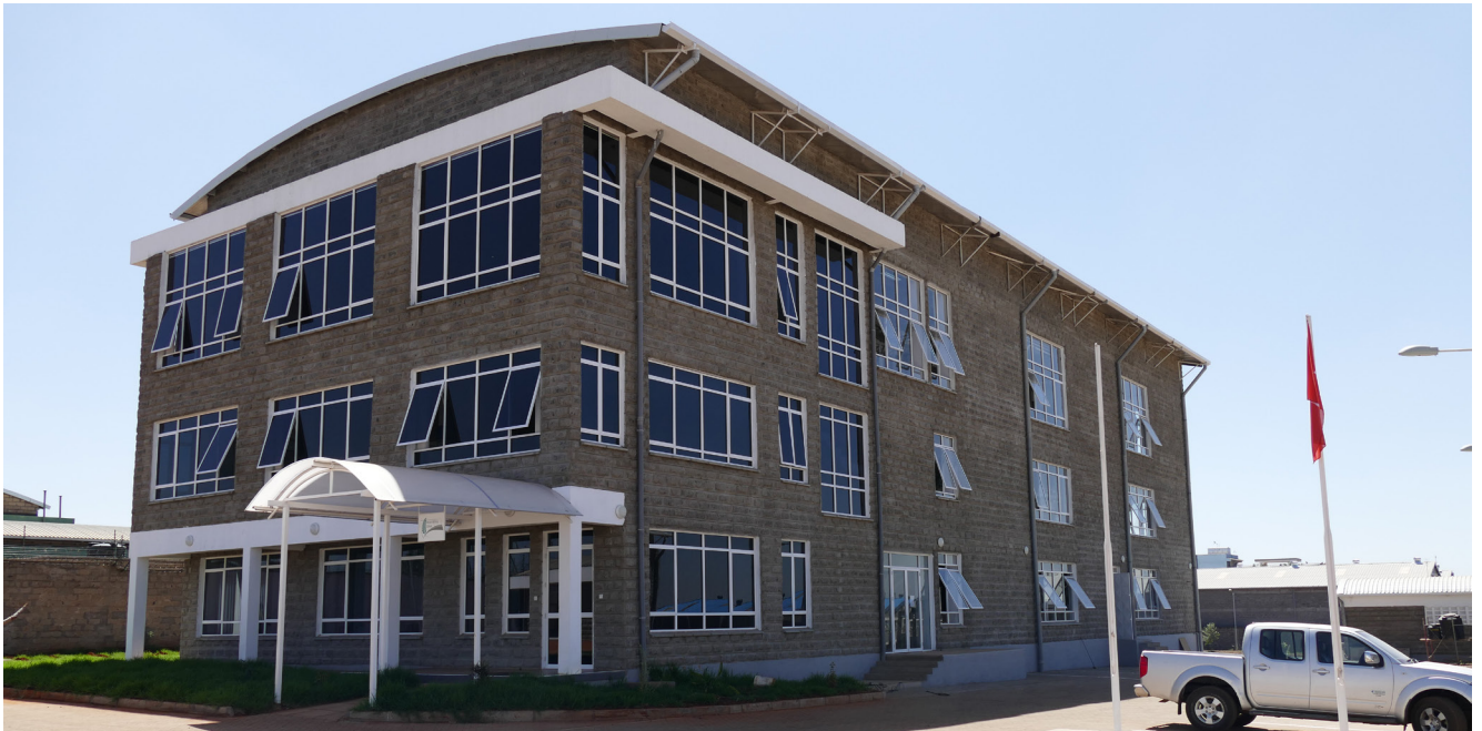
African Milling School