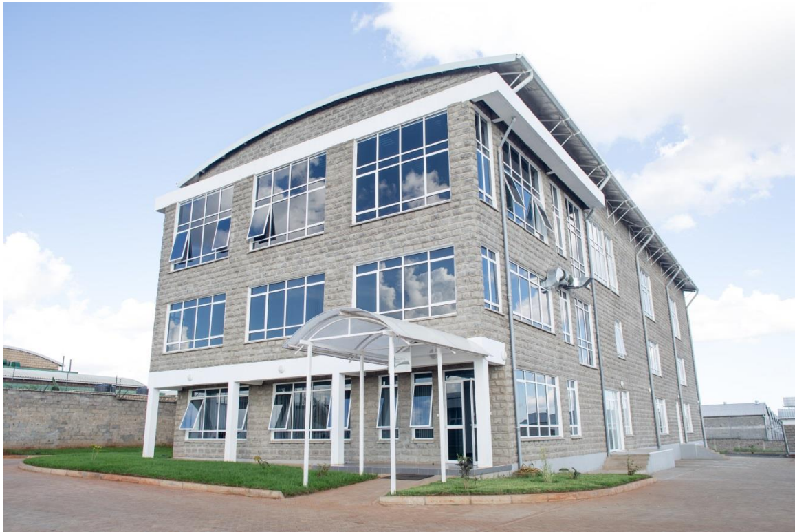
African Milling School